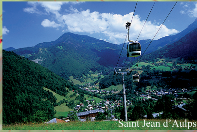
Saint Jean d'Aulps